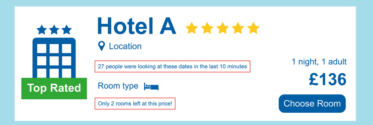
Figure 2: An illustration of an online hotel booking page with scarcity claims

The CMA was concerned that some platforms used untrue or misleading scarcity claims to create a false impression of limited hotel availability and rush consumers into making a booking decision. For example, the CMA investigated whether the demand-framed scarcity claims about other people viewing the hotel sometimes included those looking for different dates or different room types, and whether the claims sometimes used vague language like "right now". The CMA was also concerned that supply-framed scarcity claims about the number of rooms left were sometimes based on incomplete information, and that there could be rooms available for the same hotel on other platforms. Another concern was whether 'sold out' hotels were also shown within search results to increase the impression of limited availability, potentially inducing feelings of loss aversion in consumers.